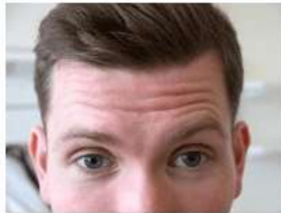
Crease up the forehead