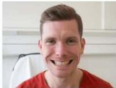
Reveal the teeth