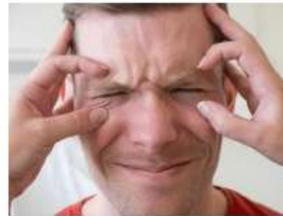
Keep eyes closed against resistance